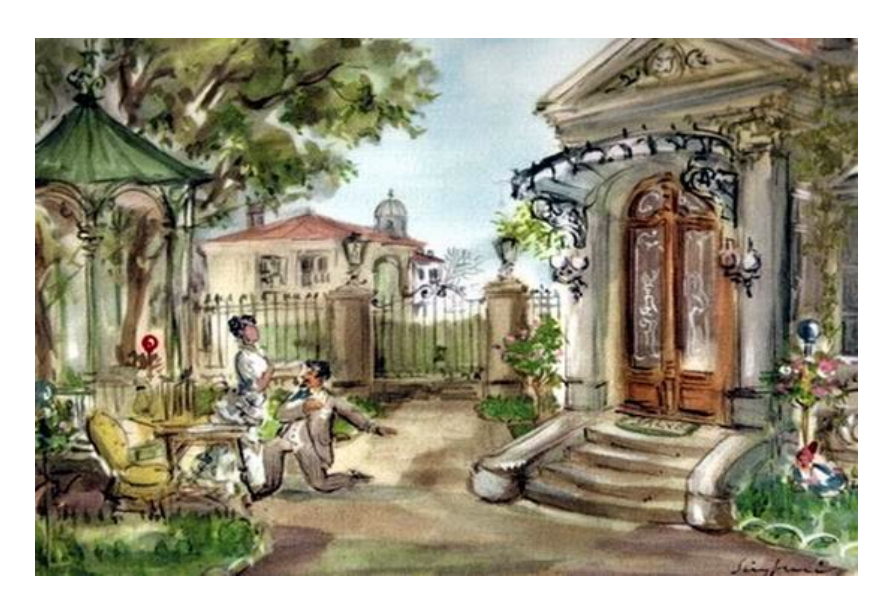
Fig.2: Sketch by Walter Siegfried for the Sică Alexandrescu production at the National Theatre Bucharest

The tree that K.N. Roy<sup>15</sup> talked about in the Bengali production towered over the last scene in the Romanian production both in its stage and screen adaptations (Fig. 2).