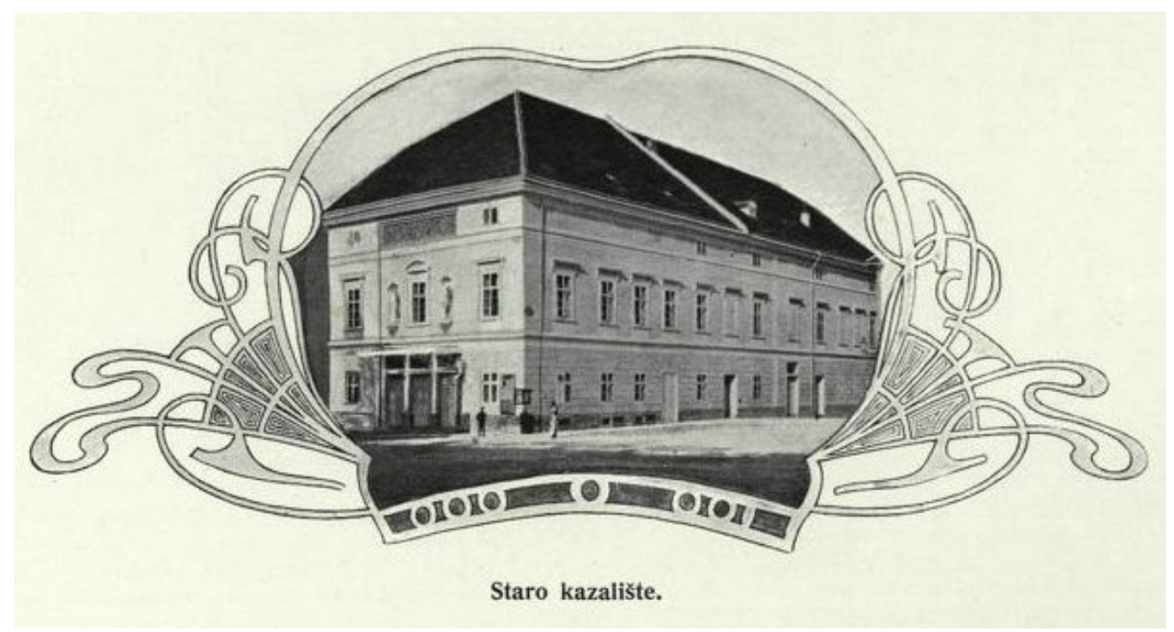
Fig. 4: Kaiserlich freistädtisches Theater in Zagreb: rented to German theatre companies from 1834 to 1860.