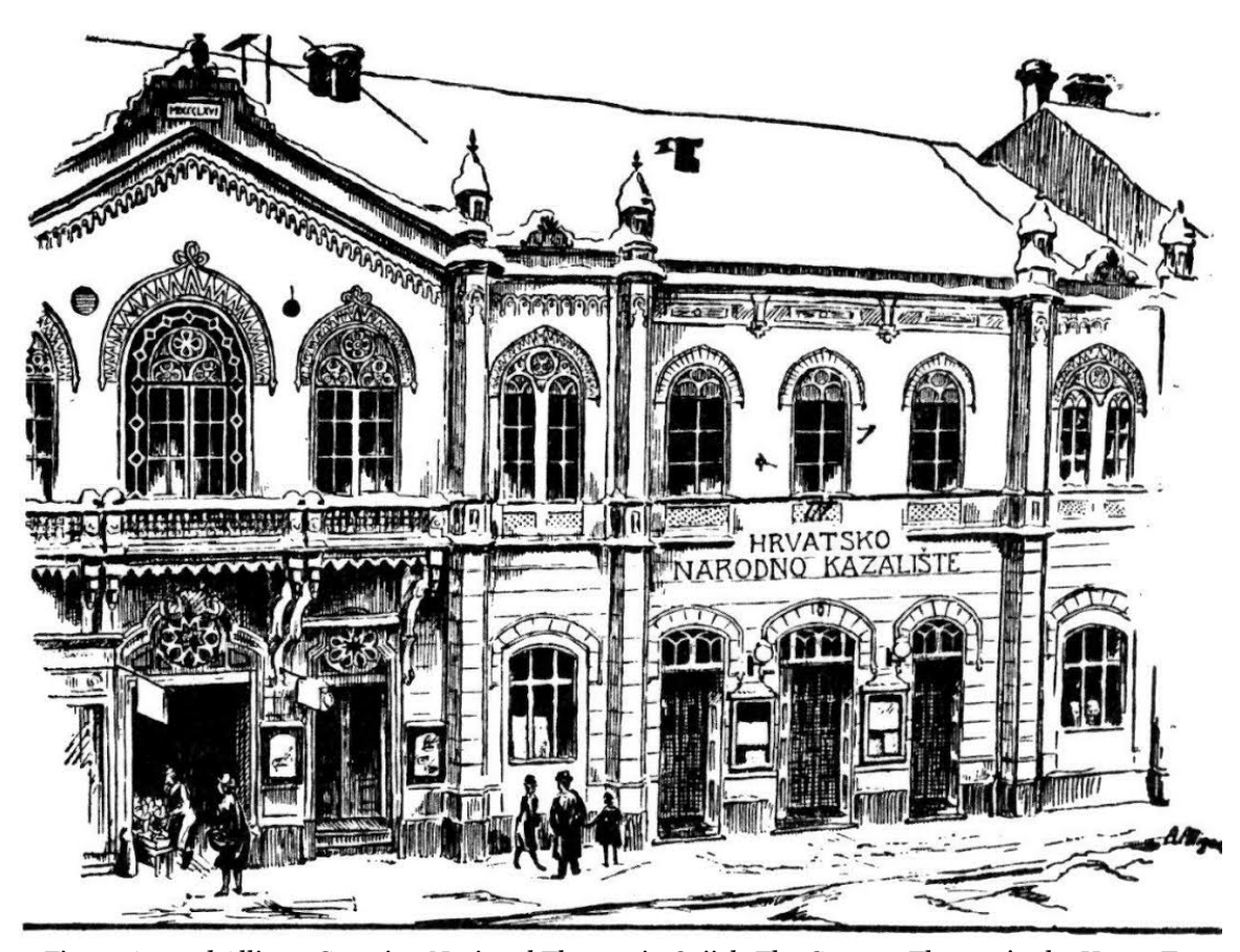
Fig. 3: Amand Alliger, Croatian National Theatre in Osijek. The German Theatre in the Upper Town from 1866 until 1907.