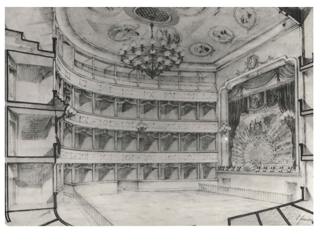
Fig. 5: Kaiserlich freistädtisches Theater in Zagreb. Aleksandar Freudenreich's reconstruction.