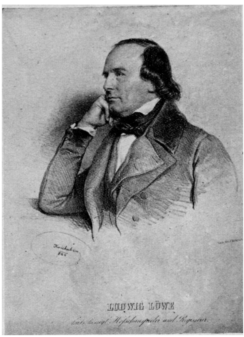
Fig. 1: Ludwig Löwe.

The press was full of superlative praise. The German-language journal Luna, called Löwe's Hamlet a work of a "genius mime" 20 and the Croatian-language journal Danica wrote about the enthusiastic audience who called him the "German Garrick"<sup>21</sup>. While the German press focussed on an aesthetic analysis of Löwe's performance, the Croatian press reported extensively on the social sensation caused by the presence of the great artist in the city and its surroundings.<sup>22</sup> Löwe chose a predominantly tragic repertoire for the Zagreb guest performances. His best roles were Ingomar in Friedrich Halm's drama The son of the wilderness – one of the most frequently performed contemporary plays – Shakespeare's Hamlet and Roderich<sup>23</sup> in Pedro Calderón de la Barca's play Life is a Dream. Despite the "tropical heat" in the theatre, Löwe had "magical effect" on the audience.24 His natural representation of the role, which was praised as the greatest achievement in contemporary criticism, was enthusiastically received by the audience.<sup>25</sup>