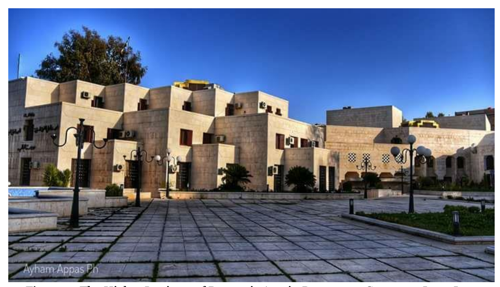
Figure 1: The Higher Institute of Dramatic Arts in Damascus.

When it was first founded, the theatre institute was located in Dommar, a small suburban neighbourhood in Damascus. Although the area was considered conservative, students and teachers recall safety and intimacy with the building and the neighbourhood. The building expanded as student numbers increased and when the Criticism and Theatre Literature department was opened. The institute remained there for about thirteen years, till it moved to the Opera House complex at the significant Omayyad Square. The new building (Figure 1) combined the two departments of the theatre institute with the Higher Institute of Music, and the Ballet School, emphasising the artistic and the 'civilised' image of the institute. Later in the 2000s, the Scenography Department and Technical Theatre Department were opened.