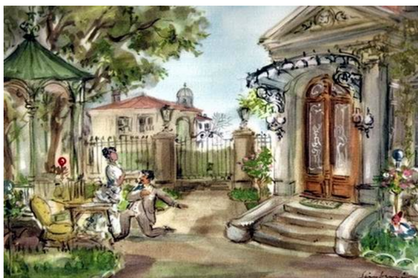
Fig.2: Sketch by Walter Siegfried for the Sică Alexandrescu production at the National Theatre Bucharest

The tree that K.N. Roy 15 talked about in the Bengali production towered over the last scene in the Romanian production both in its stage and screen adaptations (Fig. 2).